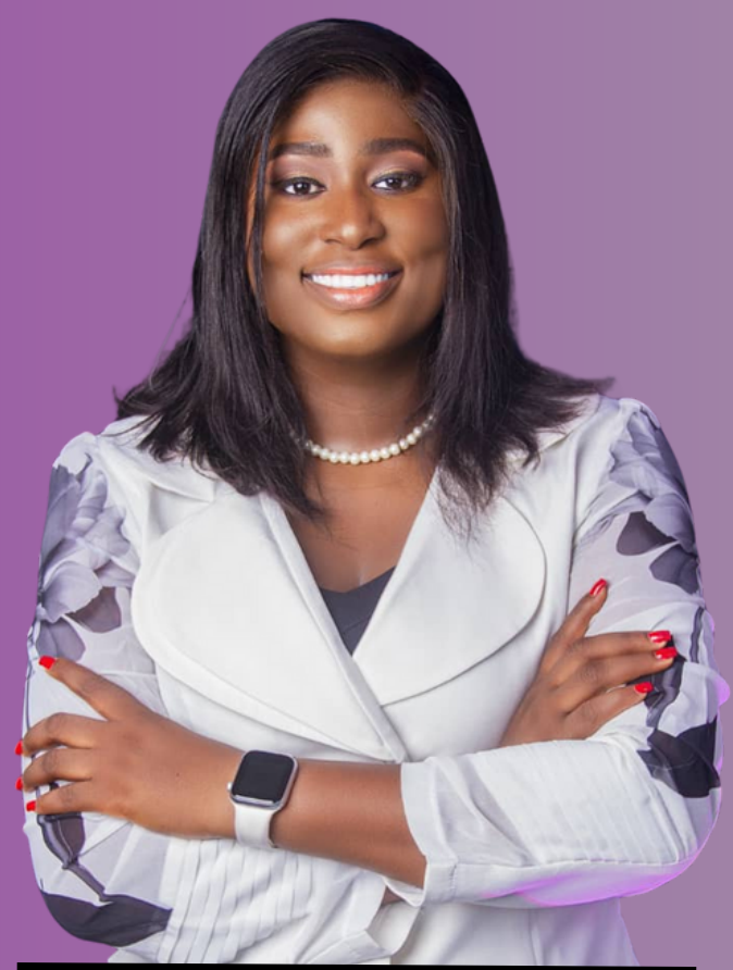
"No matter where you are or what mistakes to be different. You are uniquely gifted and equipped for this journey called life."

But here's the truth: You are the greatest shareholder in your life. The decisions you make today can change the entire trajectory of your life and destiny over the next 5-10 years. You might be wondering how I know this—I'm living proof. I grew up in a place where being average was the norm and negative influences were all around. I watched some of my classmates drop out of school after becoming pregnant in junior high, while others chose to live "bigger than their means" because of peer pressure and a need to feel valued. you've made in the past, you can choose today Yet, despite these challenges, I stood out.