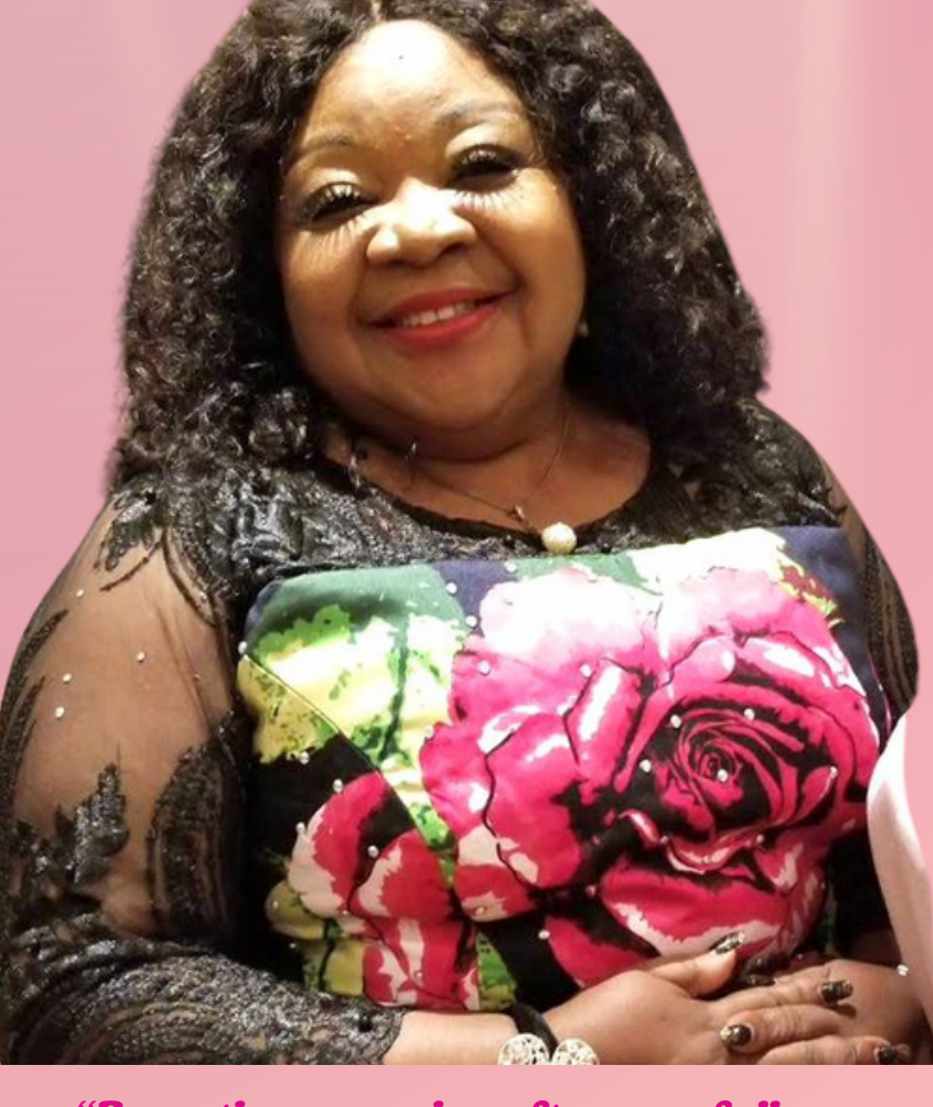
"Everytime you rise after you fall It is a reminder that challenges are meant to be overcome"